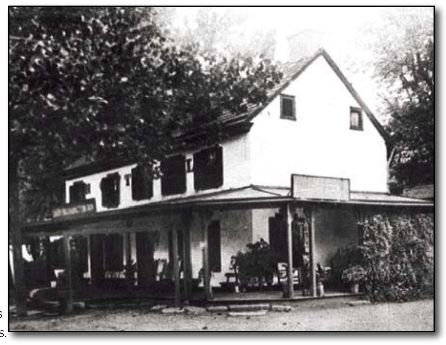
The Lady Washington Hotel, 2550 Huntington Pike, was the first Huntingdon Valley Post Office, in 1823.